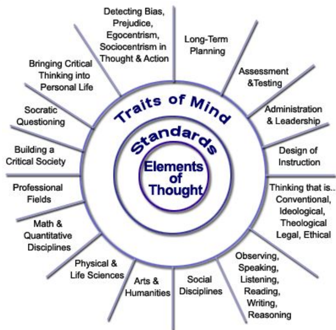
Figure 1: The actual influencing factors of record thinking

In the process of cultivating record-based thinking, radio and television directors must first learn the basic knowledge, and secondly receive more training on thinking creation and recording thinking, and better find the starting point of new thinking in the creation. For example, in the process of creation, TV works are usually carried out by using the mode of collective creation. This mode will also hinder the members' creation of results, which will also have certain hindrance effects, as shown in Figure 1 below: